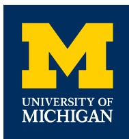
↑ OFFICIAL U-M LOGO